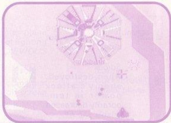
Ando Ageanesis Floating Fortress